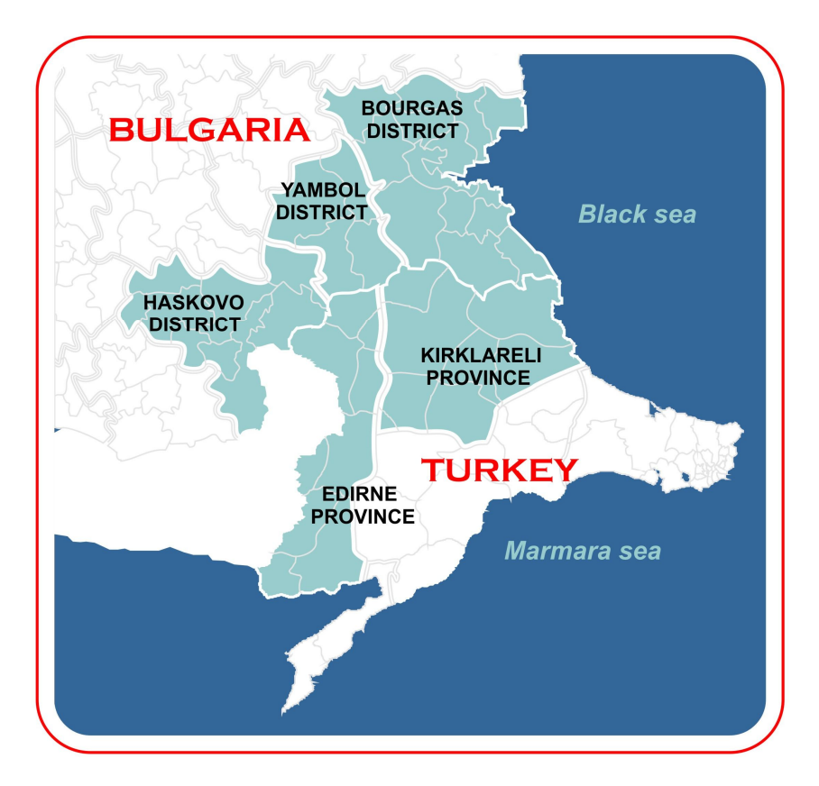
Geographical structure of the co-operation area